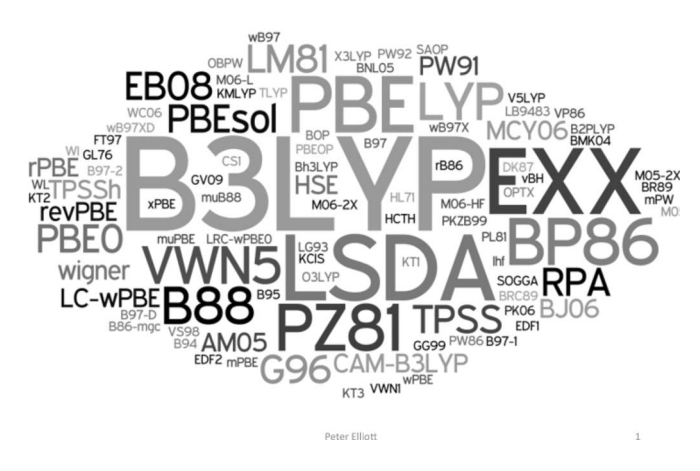
FIG. 3. The alphabet soup of approximate functionals available in a code near you. Figure used with permission from Peter Elliott.